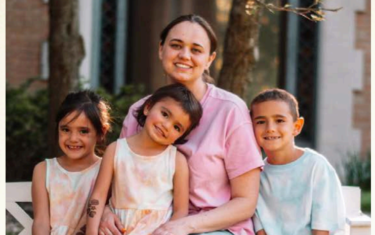
For privacy the picture shown is not of the person described in the story.